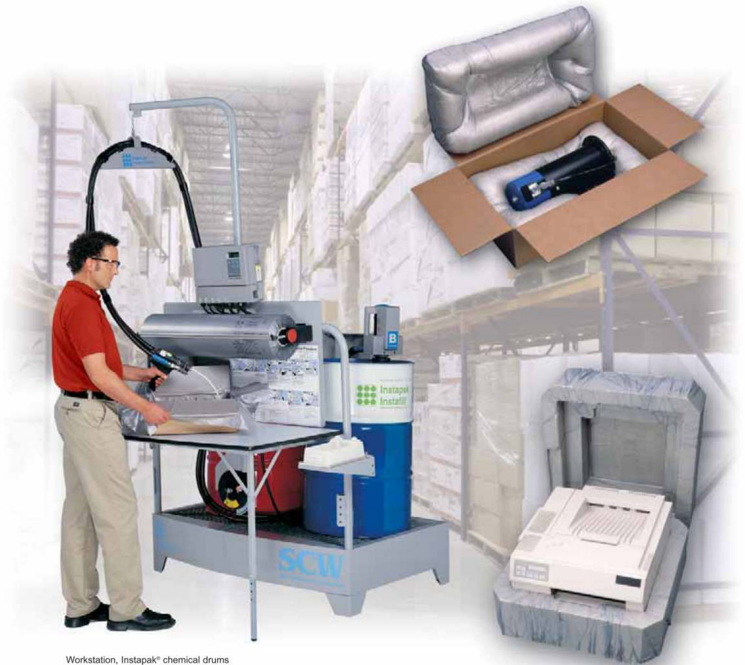
Workstation, Instapak® chemical drums and film not included.